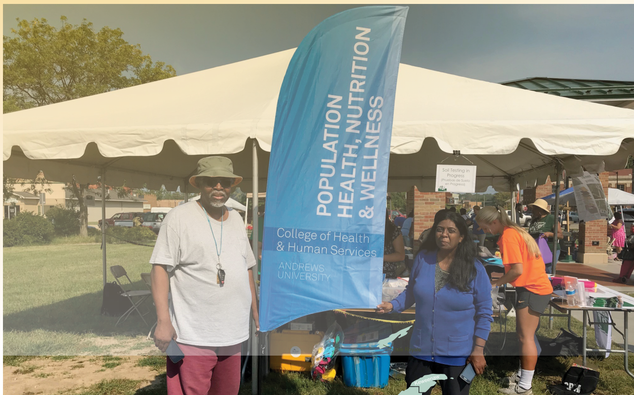
Andrews University Faculty during soilSHOP Event in Septmeber 2019 (ATSDR, 2019)