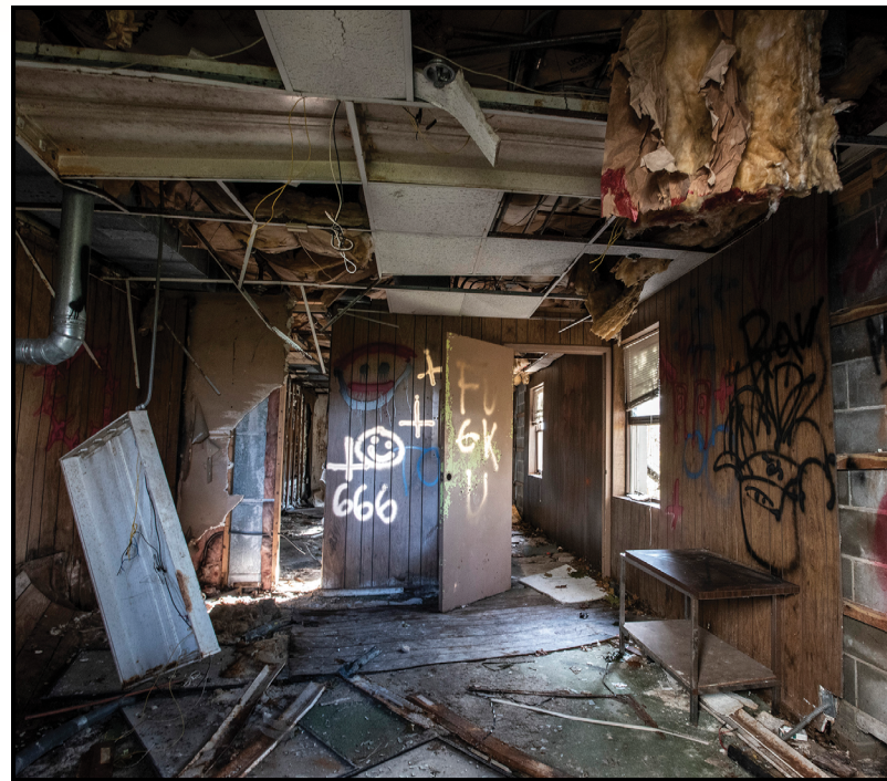
Land reuse site in Niles, Michigan with evidence of tagging. The building is not secured from public access (Lloyd Degrane, 2019)