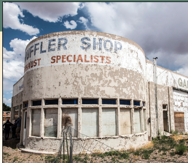
Image of a vacant and deteriorated auto service and gas station in Holbrook, Arizona

Percentage of persons under 65 without health insurance: 9.7% to 17.3%