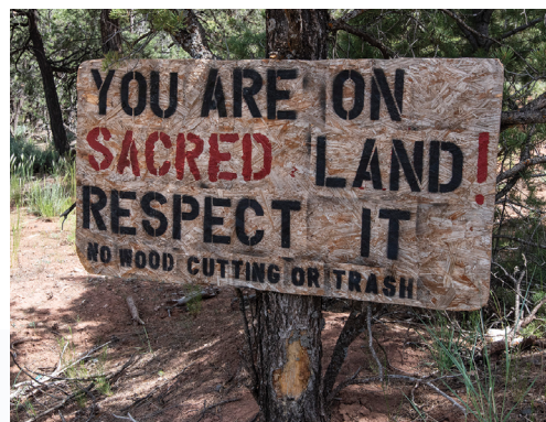
Sacred land sign on a land reuse site in Northern Arizona (Lloyd DeGrane, 2019).