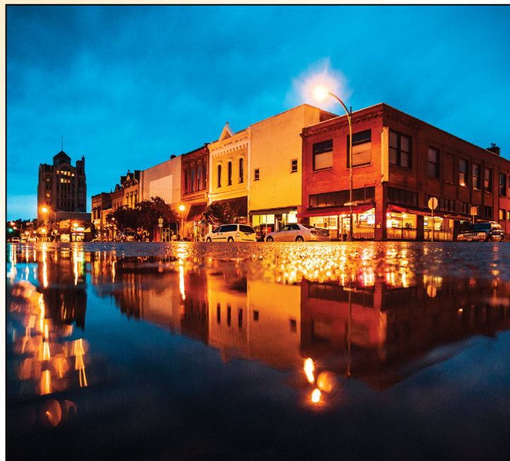
Historic Baker City