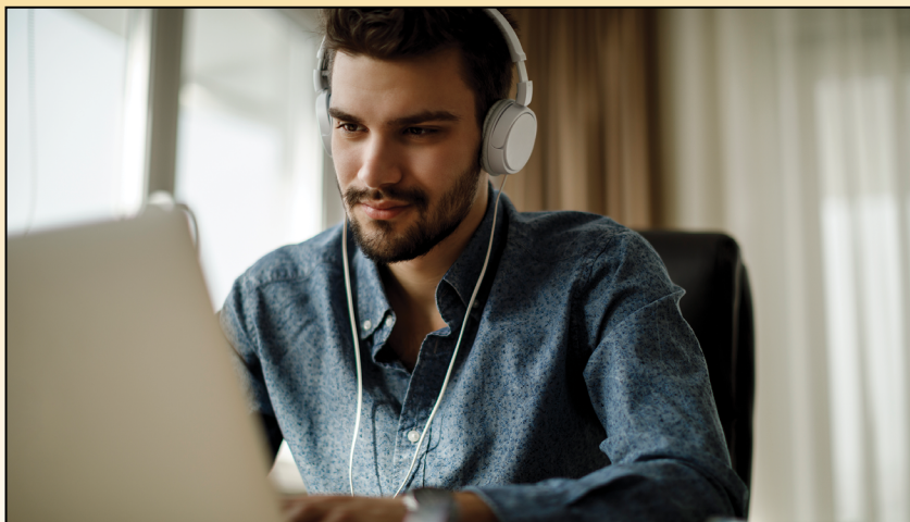
A student creating a brownfields inventory