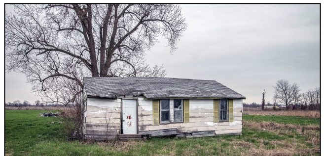
Image of an old sharecropper cottage in the Missouri Bootheel (Lloyd DeGrane, 2018).