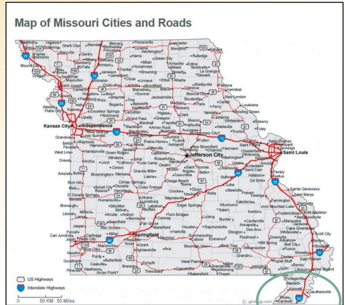
Missouri map showing the Missouri Bootheel area