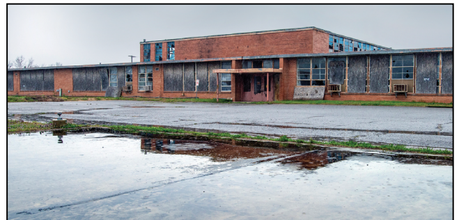
Howardville High School.